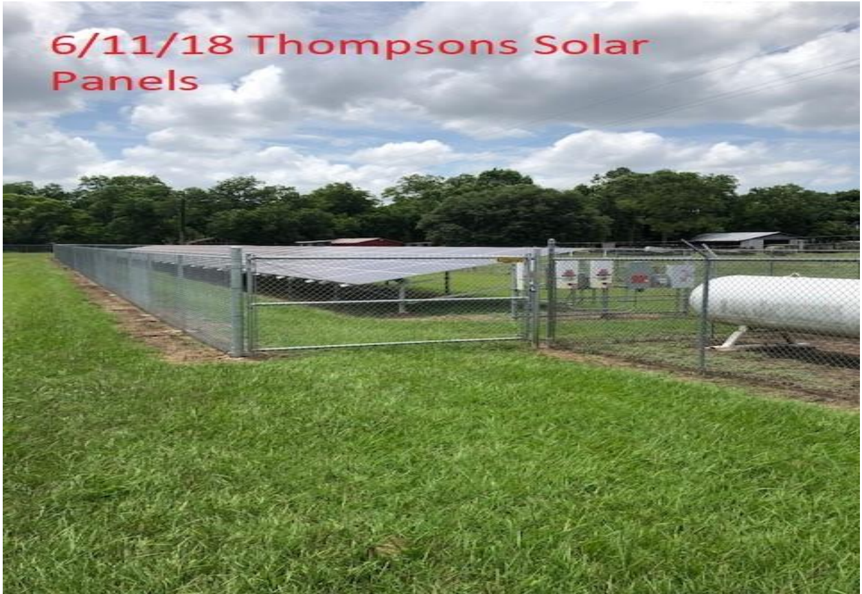
6/11/18 - Solar Farm Generator & Propane Tank